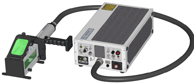
Compatible with our range of modular sample chambers